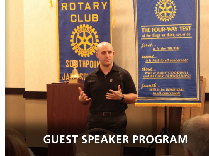
GUEST SPEAKER PROGRAM