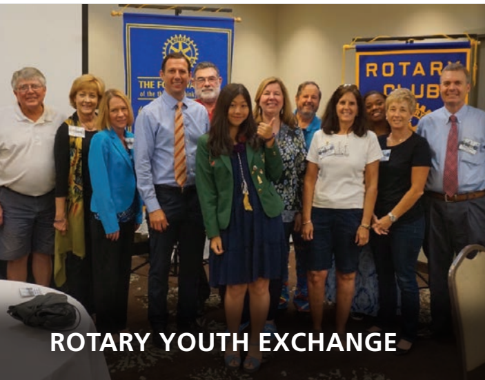
ROTARY YOUTH EXCHANGE