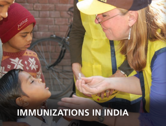
IMMUNIZATIONS IN INDIA