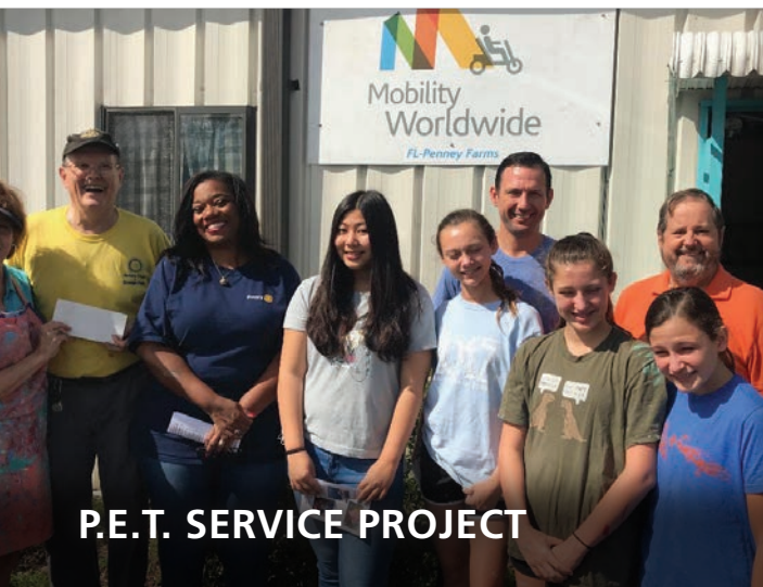
P.E.T. SERVICE PROJECT